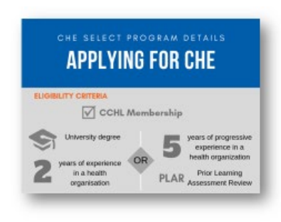
Figure 1 – CHE Select Program